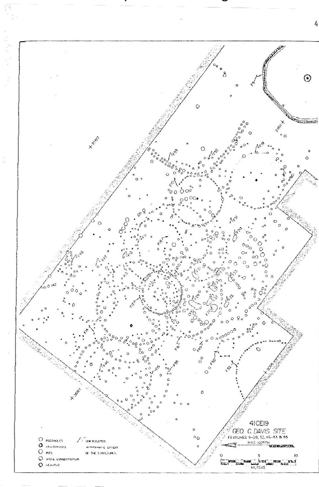
Figure 1. Post Holes Discovered at Caddo Mounds. Carolyn Spock, 1977.